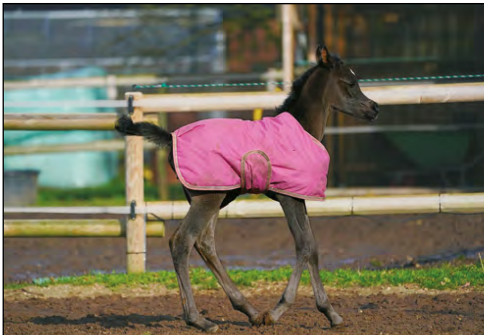
ASE Gioia el Yas (AJ Yas x Geraldynne el Jamaal)