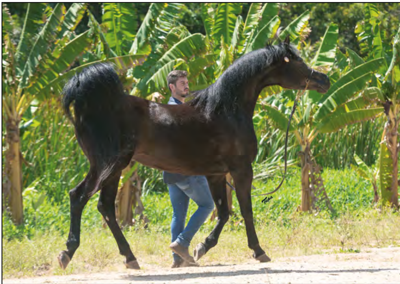
Stig Josephine (Henno Serondella x Geraldynne el Jamaal) – owned by MAR Arabians, Brazil