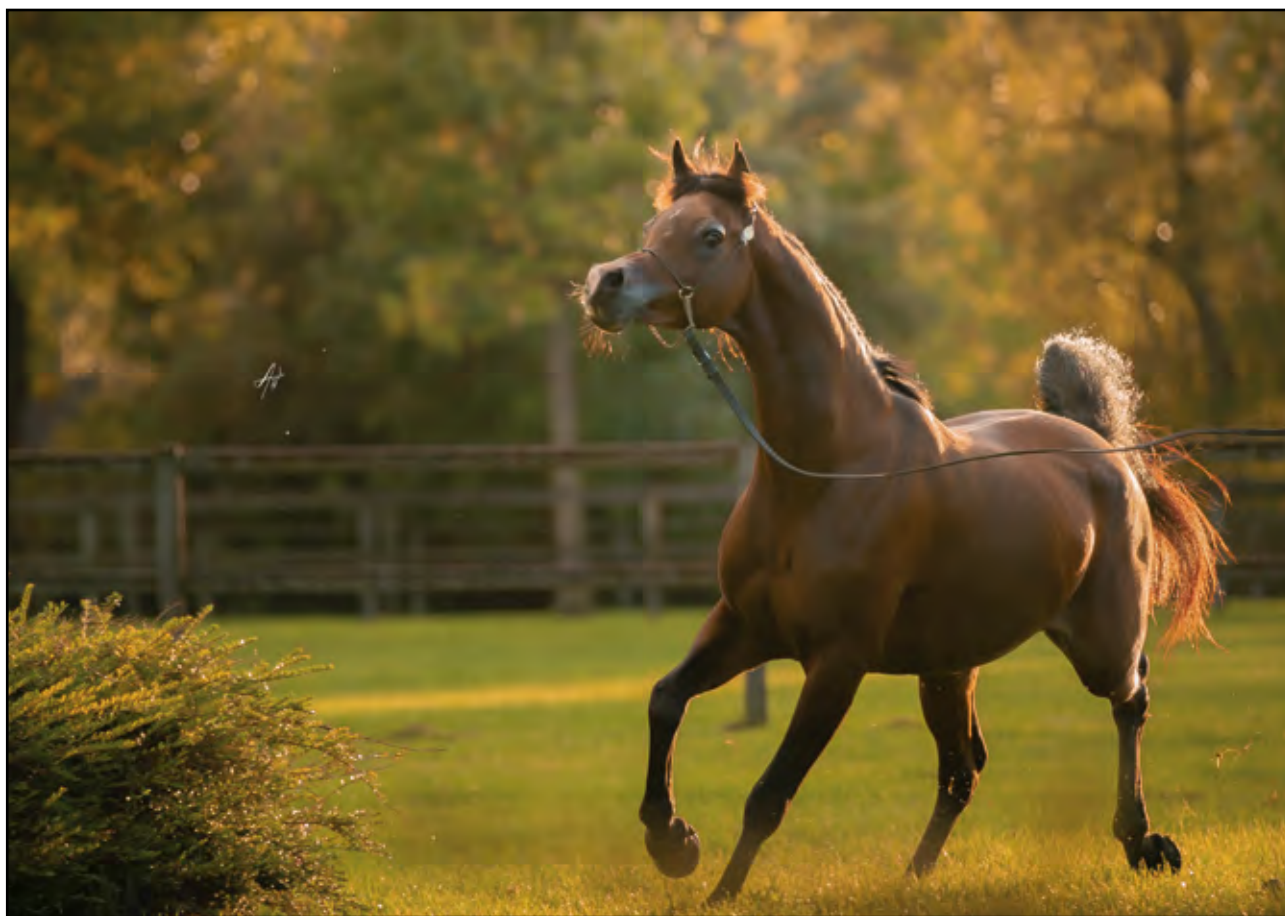
Geraldine el Jamaal (Ali Jamaal x Gai Natascha)

Geraldine is also a very successful sport horse. At the age of 18, she started her endurance career. Now, at the age of 20, she is competing at the highest level and was awarded with several awards celebrating her success as an endurance horse. Her most recent success was in the summer of 2022 where she achieved a 4th place at the 192km Endurance race in the German Mountains, facing more than 3000 altimeters. It is save to say that Geraldine el Jamaal is one of those horses who can just do it all!