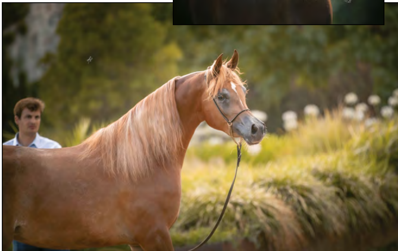
Qamar al Jood (Qaysar al Jood x Geraldine el Jamaal) – bred and owned by Al Jood Stud, Qatar