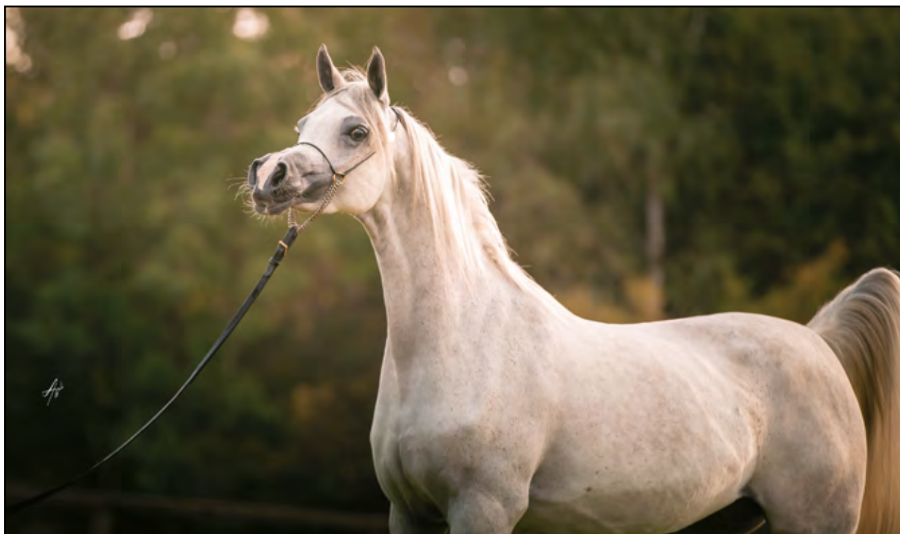
ASE Kamiliya Hlayyil (Kahil al Shaqab x ASE Bisiriya Hlayyil)