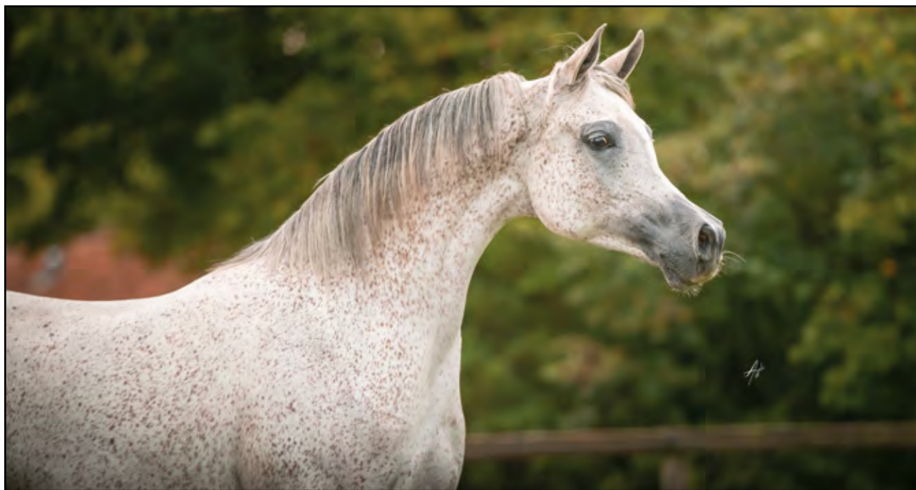
Sihaam al Salhiyah (ZT Magnanimus x ZT Fantmaisa)