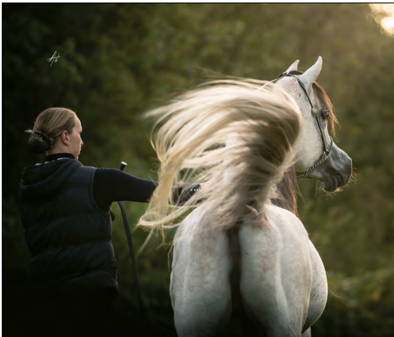
ASE Juilliard (Da Vinci FM x ASE Bisiriya Hlayyil)

Already at the age of three, ASE Juilliard has sired a National Reserve Champion filly and a Bronze champion colt! With his extreme type, incredible face with large dark eyes and tiny ears, he puts a stamp on all of his foals. With his strong legs and correct feet, he is also a great sport horse potential. His dam, ASE Bisiriya Hlayyil, was successful at the International CEI 2* endurance races of 120+km! ASE Juilliard represents the best of both worlds!